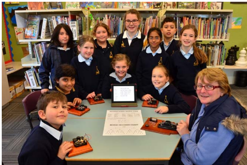
Photo 4: Morse code, the all-time, absolute favourite radio club activity. Believe it or not!

When they first hear the voices of far-off stations through the crackling sounds of shortwave radio they instantly realise they are very privileged to be listening to a larger world. You can tell when they tentatively ask you the question: "Can we talk to them too?" And they are always simultaneously amazed, excited and a little terrified at the response: "OK, why don't you try." But without exception the look on their faces, when a station first acknowledges their name over the air, has to be seen to be believed.