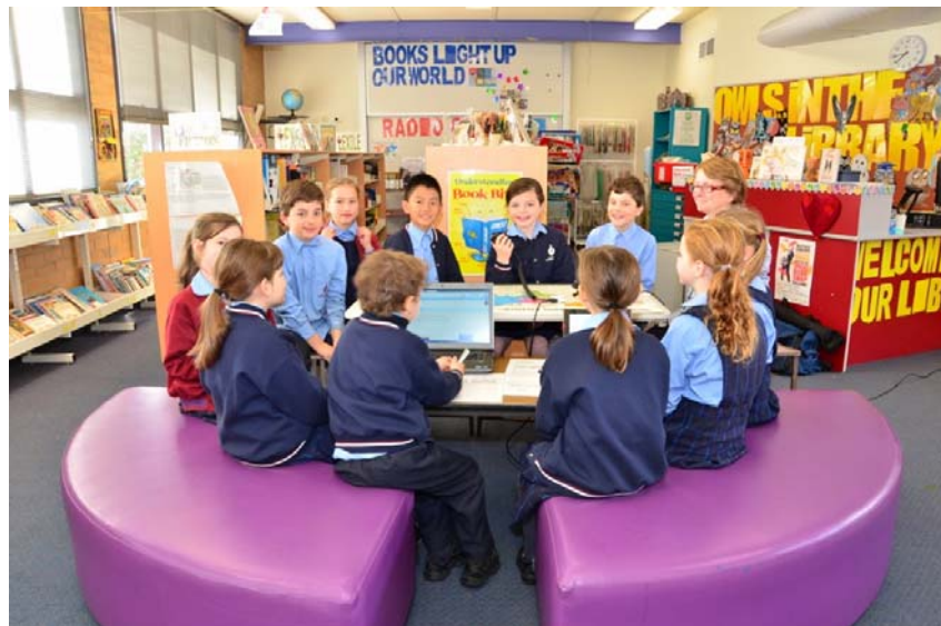
Photo1: School Amateur Radio clubs cater for a select group of students.

Recently, there has been a resurgence in Amateur Radio participation due to simplified licencing conditions, the availability of low-cost radio equipment and no minimum age requirement. This has provided a new opportunity for primary school students, even as young as nine, who have successfully obtained their own Amateur Radio foundation licence.