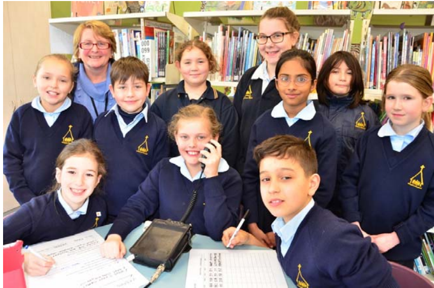
Photo 3: Everyone in the group is equal; has a job to do and you have to be polite!

So what does it take to interest primary school students in Amateur Radio these days? Well, for a typical group with enquiring minds and not much else to do at lunch time, surprisingly very little. For a start they are way smart enough to realise this is a whole different thing from mobile phones, social media and the Internet.