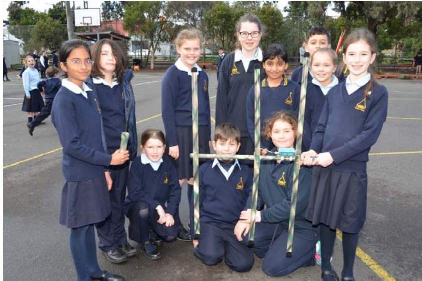
Photo 10: "It's those radio club kids again. What are they doing now? How do you join?"

There are also some practical exercises to do like: Building and testing your own radio antenna; building your first electronic project kit, tracking down sources of local radio interference and finding hidden transmitters in the playground. These activities are intended to provide the students with a taste for scientific enquiry, observation, research, experimentation, analysis and testing. Through Amateur Radio they realise they are part of a larger world and who knows where it will take them from there?