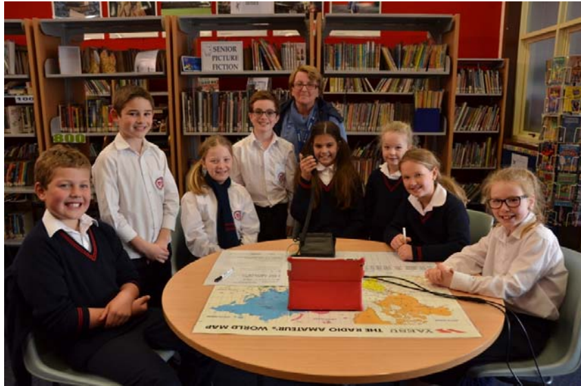
Photo 5: It is important to keep the conversation going... "What's your dog's name?"

As all Amateur Radio operators know, when you are on the air you must be respectful and courteous to others at all times. You are an ambassador to your school, to your state and to your country. You have to say "good morning" or "good afternoon", remember to give your name and to properly introduce the other members of your group. This is probably the most unexpected part of Amateur Radio for the students and it often requires a little practice. It is true that with great privilege comes great responsibility.