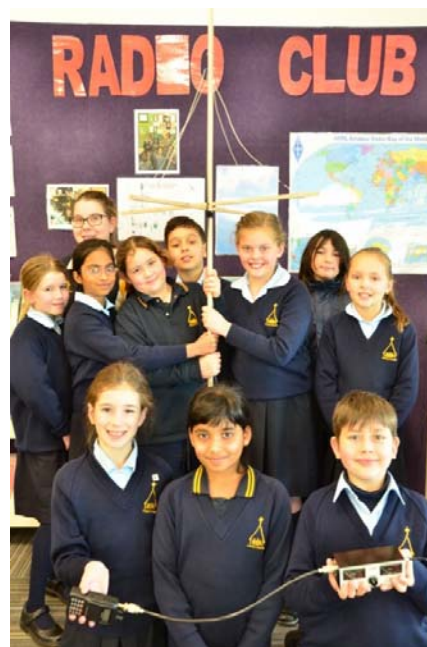
Photo 8. Crazy antenna building project.

It is not all hard work, though. There are also games, videos and activities to make each session more exciting. And to be fair, all this learning is just for fun and it does not substitute for a real Amateur Radio foundation licence course delivered by a trained examiner. But that is really the whole point: School Amateur Radio clubs are just a fun experience to get the students started.